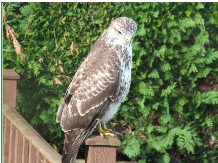
of a Visitor To her garden in Frogpool

The Gwennap Craft Group will meet on Tuesday Mornings at the Coffee Stop in the Parish rooms at the Richard Jory Playing Field from April.