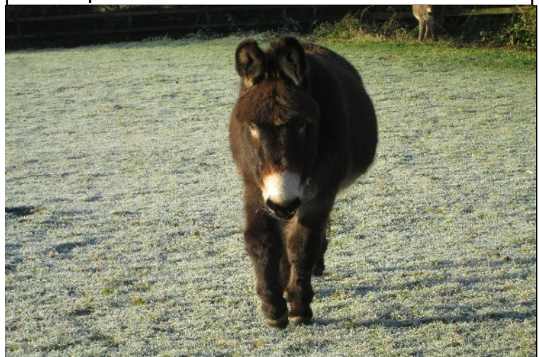
Cold morning in Crofthandy

Next charity event is a Coffee Morning on 2 nd April – 10.30 – 11.30am