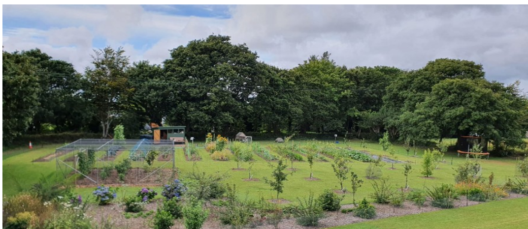
Pic 4: Summer 2020 A garden in full cultivation