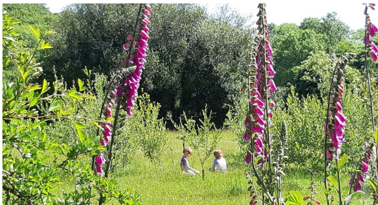
Pic 3: Long summer days in the 'den'.