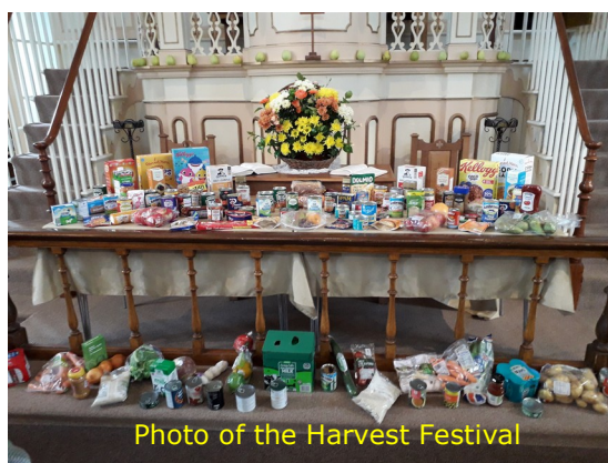
Photo of the Harvest Festival