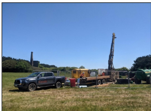
Cornish Metals’ United Downs Drill Programme – Site 4 -July 2021