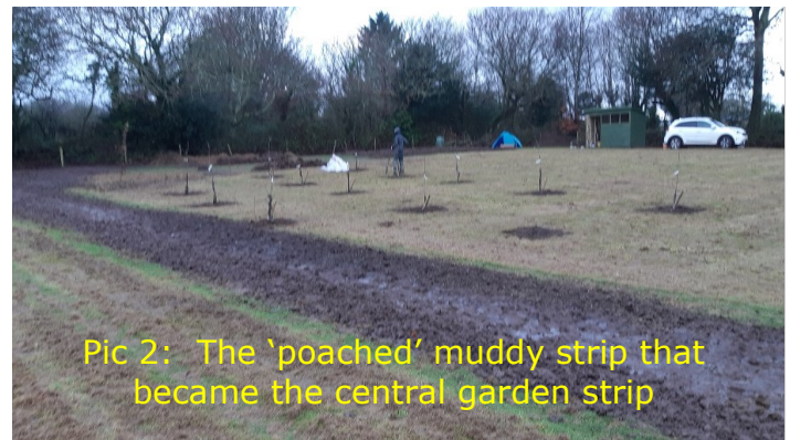
Pic 2: The 'poached' muddy strip that became the central garden strip