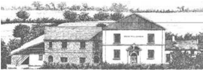
HICKS MILL METHODIST CHURCH