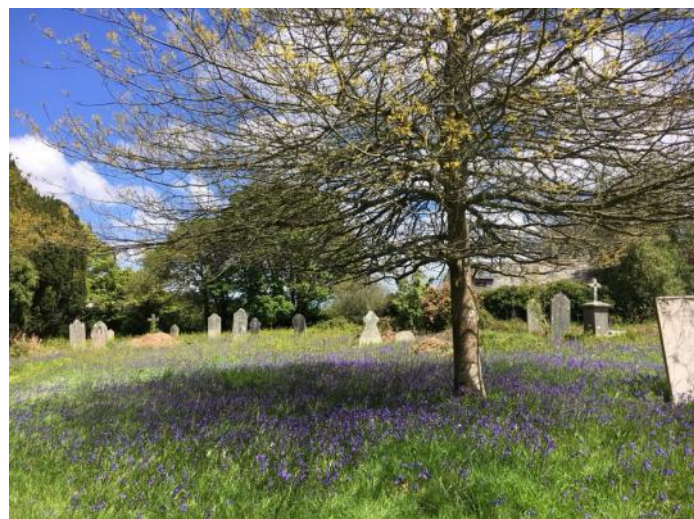
Gwennap Churchyard, May 2018

We meet each Tuesday from 10.00-11.30am in the Parish Rooms at the Richard Jory Playing Field. We always welcome new comers, so do come and have a cup of coffee/tea and meet neighbours. We plan to have some games of pétanque now the court is ready. We make no charge, but donations for refreshments go to a charity of our choice. Our charity this year is the Cornwall Hospices.