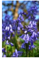
Other flowers from around the parish